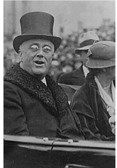
PRESIDENT FRANKLIN ROOSEVELT decried as selfish "economic royalists" those businessmen who opposed the burdensome taxes and regulations of his "New Deal."

Hoover dramatically increased government spending for subsidy and relief schemes. In the space of one year alone, from 1930 to 1931, the federal government's share of GNP soared from 16.4 percent to 21.5 percent. 12 Hoover's agricultural bureaucracy doled out hundreds of millions of dollars