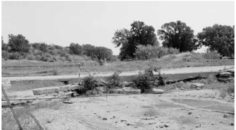
THIS 1989 PHOTO is of a bridge built from 1936-41 as part of a Works Progress Administration (WPA) project in Coleman County, Texas. Many Americans saw such projects as helpful, without considering their high cost and the corruption that plagued the program.

In his first 100 days, he swung hard at the profit order. Instead of clearing away the prosperity barriers erected by his predecessor, he built new ones of his own. He struck in every known way at the integrity of the U.S. dollar through quantitative increases and qualitative deterioration. He seized the people’s gold holdings and subsequently devalued the dollar by 40 percent. 17