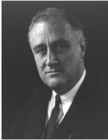
AMERICANS VOTED FOR Franklin Roosevelt in 1932 expecting him to adhere to the Democratic Party platform, which called for less government spending and regulation.

The act raised the rates on the entire range of dutiable commodities; for example, the average rate increased from 20 percent to 34 percent on agricultural products; from 36 percent to 47 percent on wines, spirits, and beverages; from 50 to 60 percent on wool and woolen manufactures. In all, 887 tariffs were sharply increased and the act broadened the list of dutiable commodities to 3,218 items. A crucial part of the Smoot-Hawley Tariff was that many tariffs were for a specific amount of money rather than a percentage of the price. As prices fell by half or more during the Great Depression, the effective rate of these specific tariffs doubled, increasing the protection afforded under the act. 9