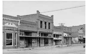
THE GREAT DEPRESSION devastated every part of America, even its smallest towns.

Old myths never die; they just keep showing up in economics and political science textbooks. With only an occasional exception, it is there you will find what may be the 20th century’s greatest myth: Capitalism and the free-market economy were responsible for the Great Depression, and only government intervention brought about America’s economic recovery.