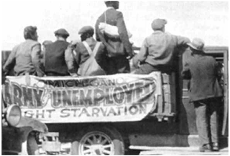
UNEMPLOYMENT SKYROCKETED AFTER Congress raised tariffs and taxes in the early 1930s and stayed high as policies of the Roosevelt administration discouraged investment and recovery during the rest of the decade.

Reckless money and credit growth constituted what economist Benjamin M. Anderson called "the beginning of the New Deal" 4 — the name for the better-known but highly interventionist policies that would come later under President Franklin Roosevelt. However, other scholars raise doubts that Fed action was as inflationary as Rothbard believed, pointing to relatively flat commodity and consumer prices in the 1920s as evidence that monetary policy was not so wildly irresponsible.