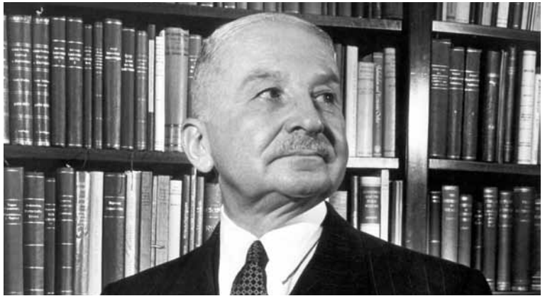
LUDWIG VON MISES understood the nature of inflation — and its source.

“Government,” observed the renowned Austrian economist Ludwig von Mises, “is the only institution that can take a valuable commodity like paper, and make it worthless by applying