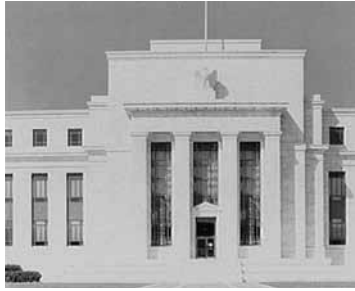
PEOPLE WHO ARGUE that the free-market economy collapsed of its own weight in the 1930s seem utterly unaware of the critical role played by the Federal Reserve System’s gross mismanagement of money and credit.

The first phase covers why the crash of 1929 happened in the first place; the other three show how government intervention worsened it and kept the economy in a stupor for over a decade. Let’s consider each one in turn.