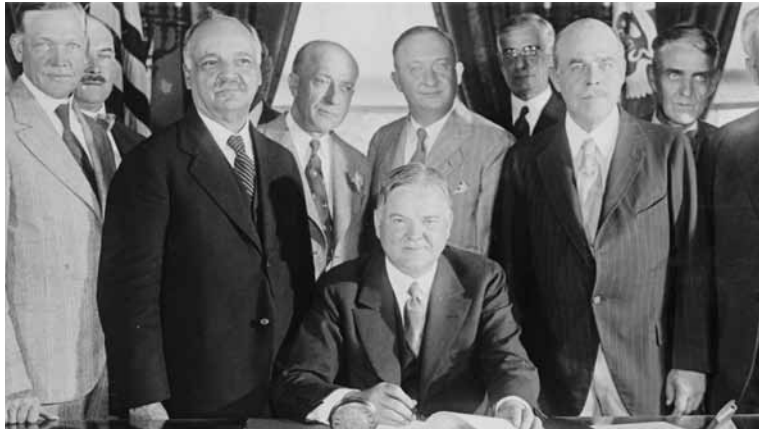
PRESIDENT HERBERT HOOVER is mistakenly presented in standard history texts as a laissez-faire president, but he signed into law so many costly and foolish bills that one of Franklin Roosevelt’s top aides later said that “practically the whole New Deal was extrapolated from programs that Hoover started.”

William C. Durant, founder of General Motors, lost more than $40 million in the stock market and wound up a virtual pauper. (GM itself stayed in the black throughout the Depression under the cost-cutting leadership of Alfred P. Sloan.)