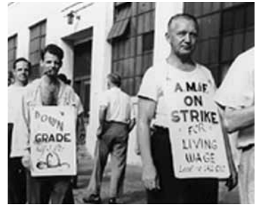
SPECIAL POWERS GRANTED to organized labor with the passage of the Wagner Act contributed to a wave of militant strikes and a “depression within a depression” in 1937.

A brief analogy will illustrate this point. If a thief goes house to house robbing everybody in the neighborhood, then heads off to a nearby shopping mall to spend his